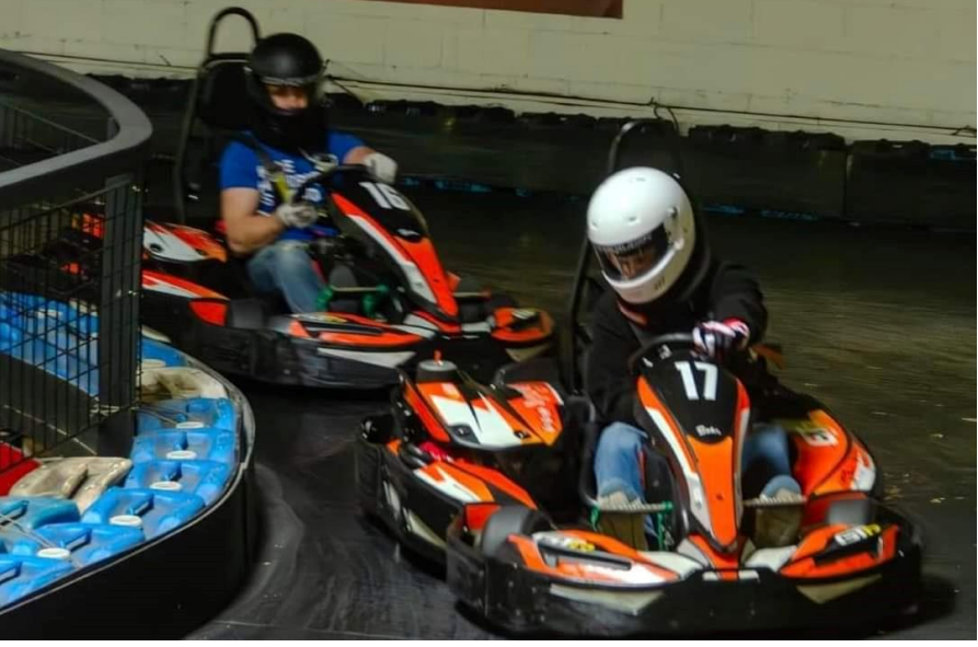
Come join us at Fast Times for our Indoor Kart Series