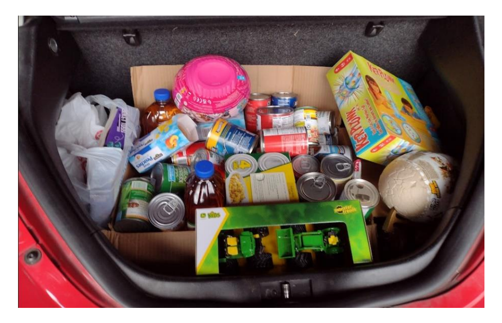
Here is the food we gave to the shelter from the December Rally.